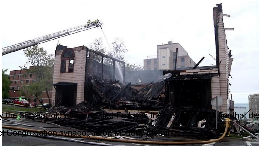
Authorities say the 36-year-old man arrested Friday in the fire that destroyed the Adas Israel Congregation synagogue on Monday.